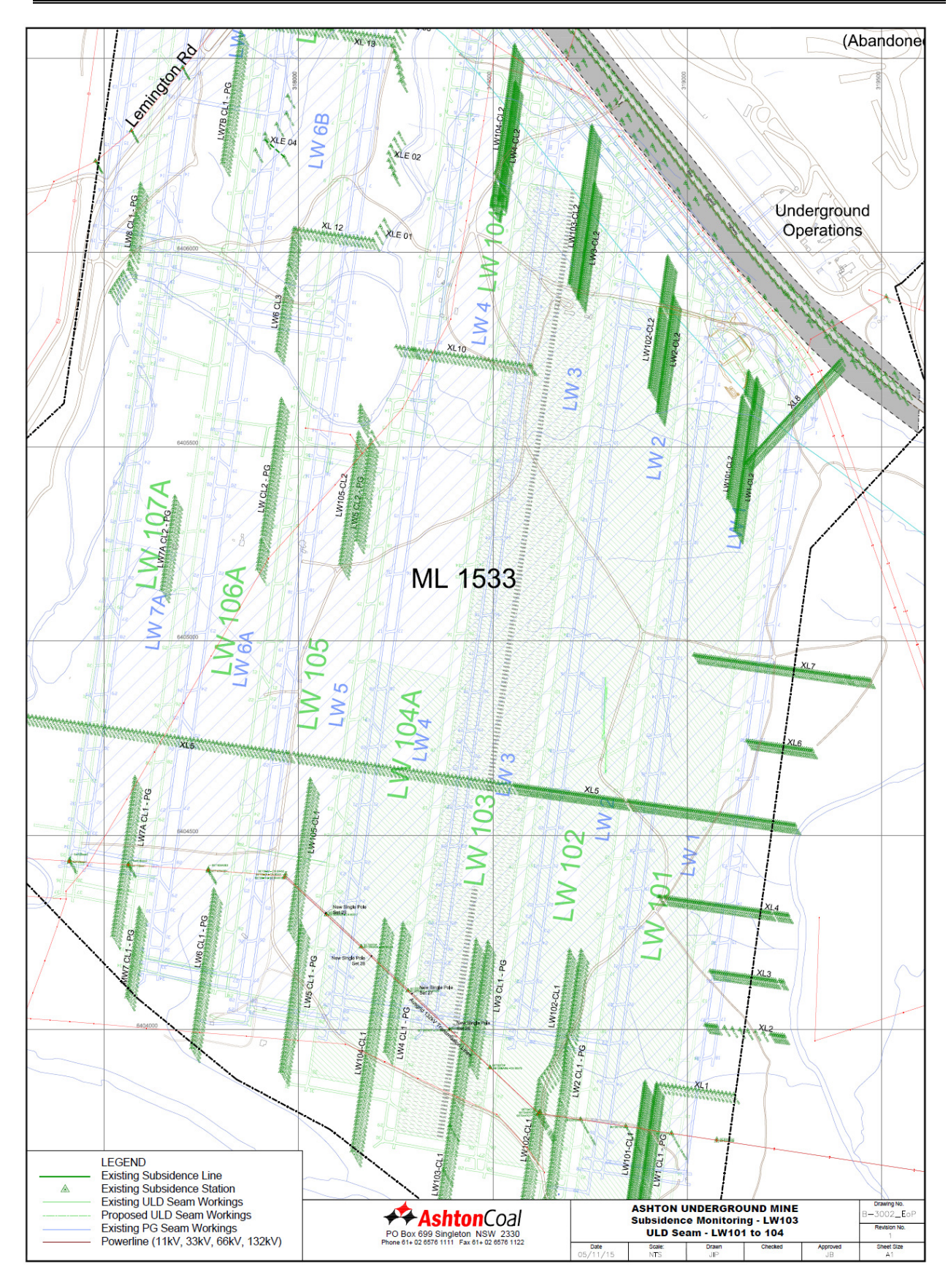
Figure 2 Plan Location of Subsidence Monitoring Lines