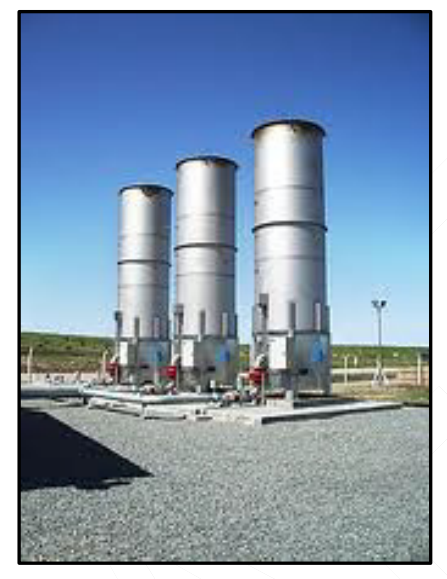
Figure 4: Enclosed flare installation

Enclosed flaring is a relatively low cost and effective solution to reduce greenhouse gas emissions, and is presently the favoured gas treatment and fugitive emissions reduction option being considered for implementation at Ashton.