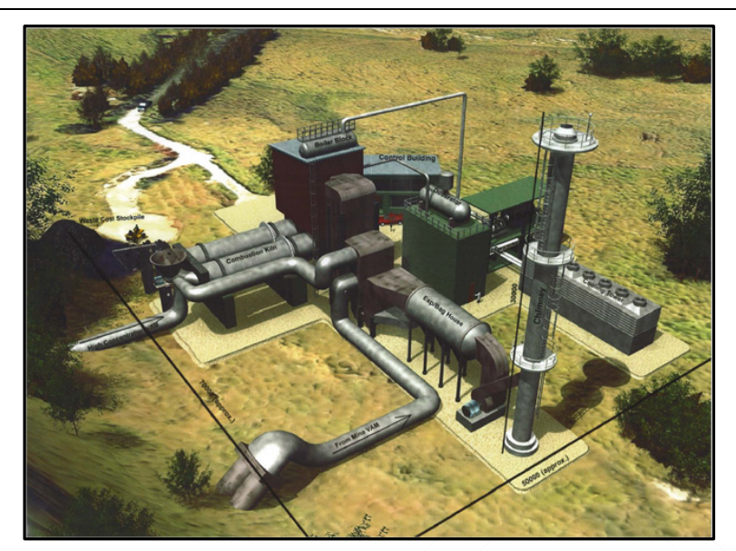
Figure 11: Conceptual layout of a Hybrid Coal and Gas Turbine (HCGT) VAM utilisation plant

The need for solid fuel, in addition to VAM, is expected to increase the overall complexity and cost of the HCGT GHG destruction and power generation plant by introducing the need for materials transport, storage and handling.