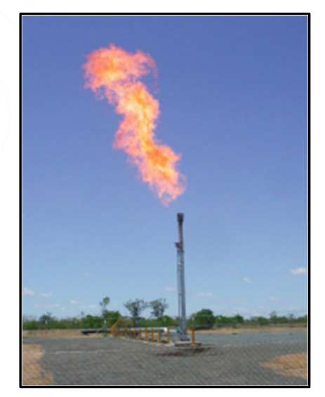
Figure 3: Open "candlestick" flare in operation

Open flares have a high gas flow capacity relative to the enclosed flares. However, they are reported to be less efficient at combusting the methane component of drainage gas (UNFCCC, 2006). Figure 3 shows an example of an open flare which emits a large open flame that is highly visible, particularly at night. This type of flare is generally not considered appropriate for use in developed areas and is therefore not a practical option for use at Ashton.