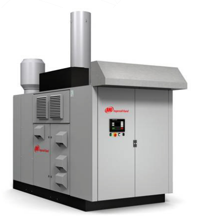
Figure 12: Ingersoll Rand Micro-turbine Unit

Ingersoll Rand was actively involved in the development of lean-fuel microturbine technology prior to the technology being sold to Flex Energy. An example of an Ingersoll Rand microturbine unit is shown in Figure 12.