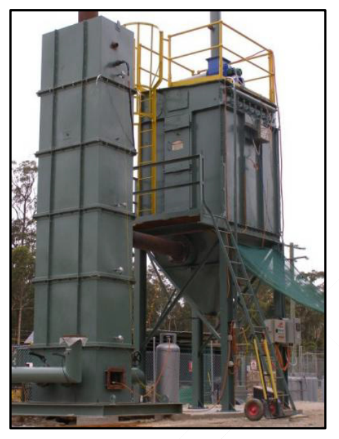
Figure 9: Development of Corky's VAM RAB Concept

A conceptual layout of a full-scale RAB VAM treatment plant, shown connected to the mine ventilation fans, is illustrated in Figure 10. The development of a full scale RAB plant capable of processing total mine VAM emissions has been reported to be some years away from being a viable option for use in coal mine VAM emissions reduction (Cork, 2011).